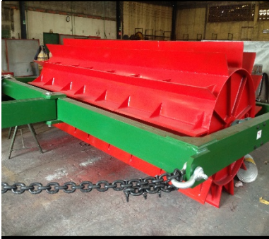
Chopper Blade Unit

All of our units are customizable with additions available, including seeder packages and custom colors.