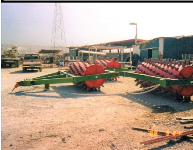
Triplex Single Drum Unit

Prices do not include freight to final destination - freight determined by delivery location.