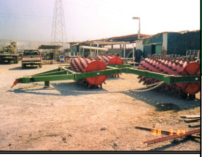
Triple Single Drum Renovator

Weights will differ with addition of Hydraulic Lifts