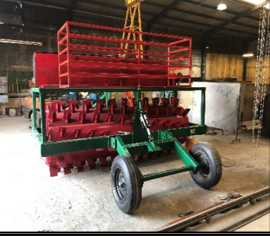
Single Drum with Seeder Box & Lift

Prices do not include freight to final destination - frieght determined by delivery location.