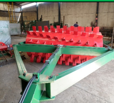
Single Drum Renovator